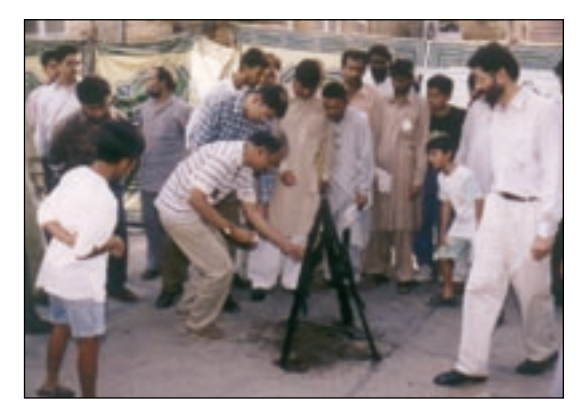
Lightening the flames to burn the guns: the message goes loud and clear

Any talk of enforcing the rule of law in a society where difference of opinion between ordinary citizens are now being routinely resolved on the point of the gun can at best be termed as idle talk. So, how can the sanity of a civil society be preserved and nurtured amidst the death rattle of a Kalashinikov!