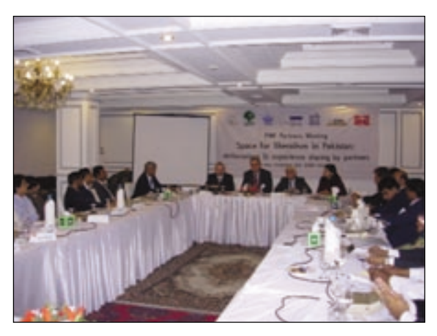
Shehri delegation attends an FNF Partners meeting

essentially provides an opportunity for activists to come together to discuss thematic ideas, exchange information, and inspire each other and most importantly to develop networks. Shehri-CBE's contribution to the IAF Pakistan Alumni pool is as follows: