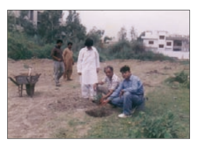
Adopting a Park