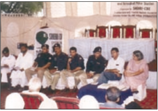
Top: Public information on the procedure for reporting a crime

Bottom: Building trust with the local police