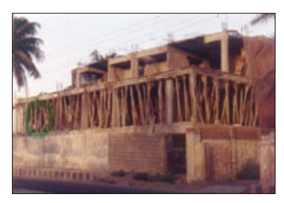
Strict monitoring of illegal constructions required

Shehri and other committed citizens of the city kept up with their demands for the re-notification of the 'Oversee Committee' and as a result, not only has the 'Oversee Committee' was re-notified but its powers and functions were also enhanced.