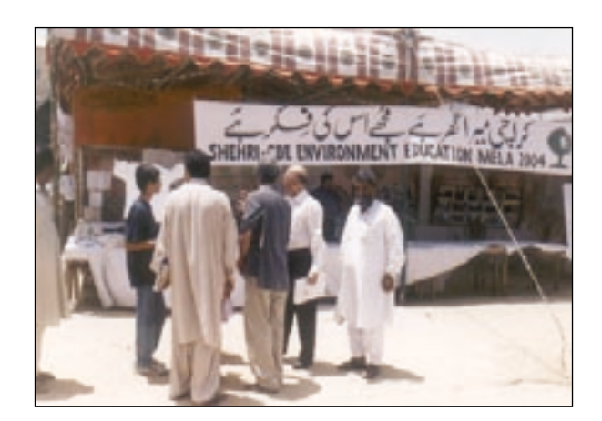
Caring for the City – the Environment – Education Mela