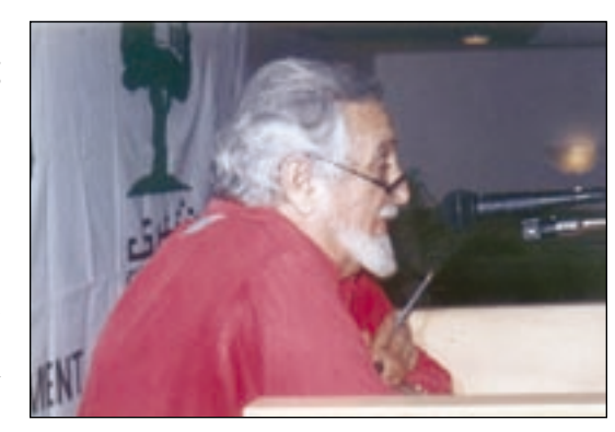
Ardeshir Cowasjee: A tireless citizen rights campaigner

Brief Facts: A building known as "Costa Lavina" was being constructed on Bagh-e-Ibne Qasim, Clifton, facing Arabian Sea, on a site which was earmarked for a revolving restaurant but which was got converted for a flat site for a 15 storey building. This conversion of land use was assailed by public-spirited citizens who filed a constitutional petition in the High Court. The matter went up in appeal to the Supreme Court and it was decided by a bench comprising five honorable judged. The judgment was authored by the Chief Justice of Pakistan. Some important precedents set by the Court are discussed as follows: