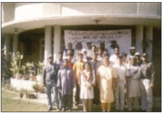
Top: Training of local community to act as Environmental Stewards

Bottom: Ending a successful training program