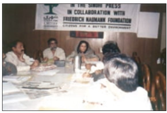
Getting going: Providing a platform for dialogue and consultation

of Karachi's urban growth and brought together on one platform, government officials, academics, citizen activists and the media to discuss issues and seek solutions. This was the participatory approach that was to define Shehri-CB's advocacy philosophy in the years to come. As Shehri-CBE progressed in its work, it was able to carve out a niche and establish a unique name and expertise for itself specifically in the issues related with urban land management and the subsequent work conducted by the organization found conformity with its following stated objectives, identified at the time of its formation: