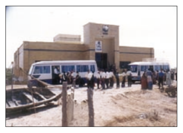
Arranging a school visit to the WWF Wetland Centre at Sandspit