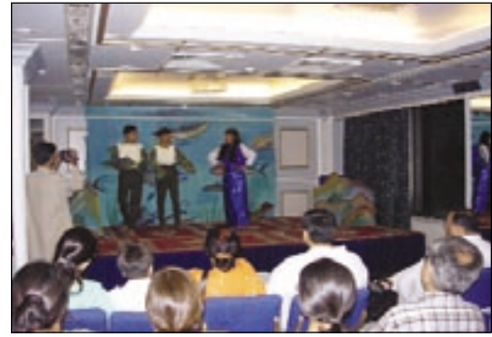
Top: Launching of the Turtle Stewards Committee

Bottom: Save the Turtles Street theatre in progress