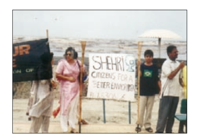
Campaign for a beach clean-up in the wake of the Tasman Spirit Oil Spill